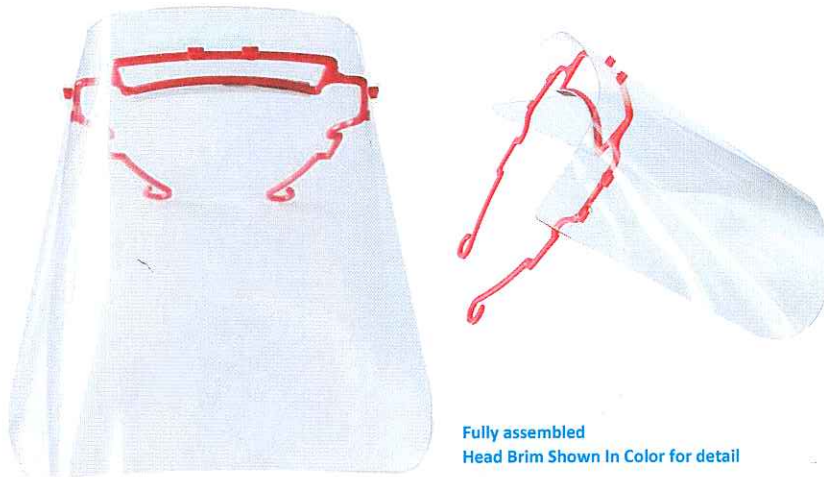
Fully assembled Head Brim Shown In Color for detail